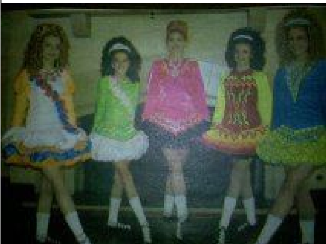
"Celtic Feet Dance Team"