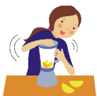
Carol & Skip

Also want to thank all the ladies who donated the small kitchen items that were also needed along with bread donations. You know who you are and we thank you very much.